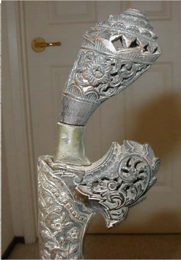
Sword 27 - Matching Silver Sewars- Sumatra Indonesia. Silver sheaths and handle. Intricately carved scabbard and handle. Note that the carving on the handle and scabbard are hollow. Handle of larger knife is very solid and has amethyst gem. $450.00 for the pair.