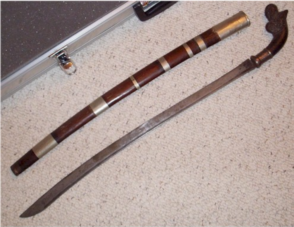
Sword 7- Pedang- Indonesia. Iron Ore blade with pamor. Horn handle with intricate carved pattern, silver ferrule. $300.00 Blade is 23 inches long. Entire sword is 28.75 inches long.