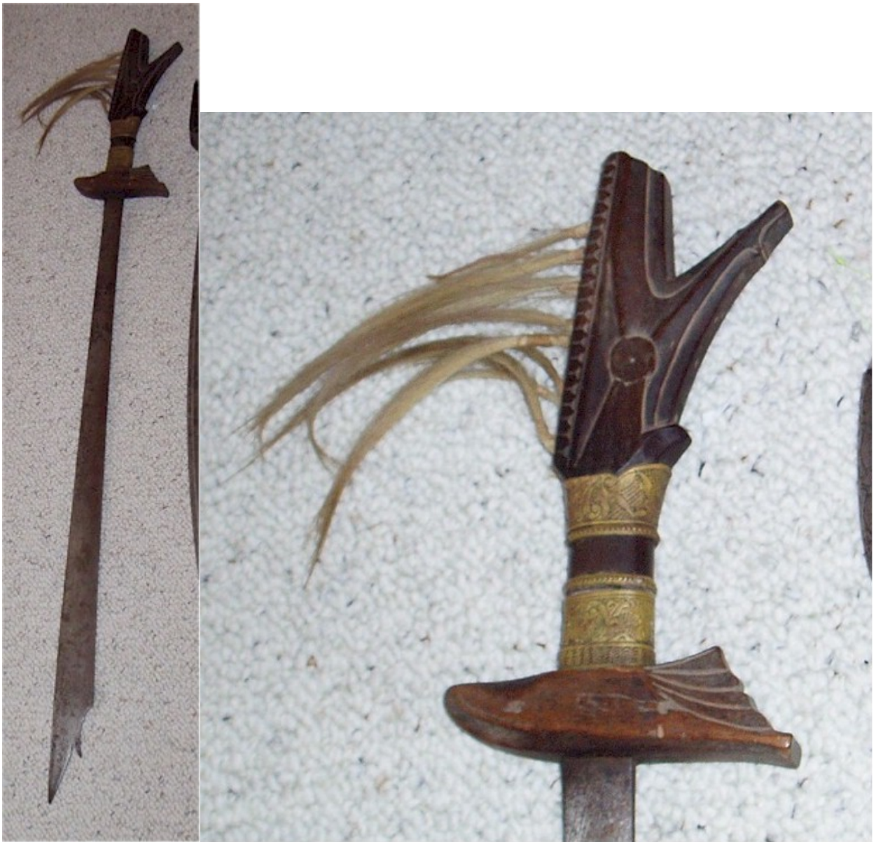
Sword 12- Kampilan- Mindanao, Philippines. Very large and old sword with wood handle. Crocodile handle adorned with blond horse hair and brass or copper ferrules. Ferrules have intricate design. $600.00 Blade is 31 inches long, entire sword 41.5 inches long, a very long Kampilan.