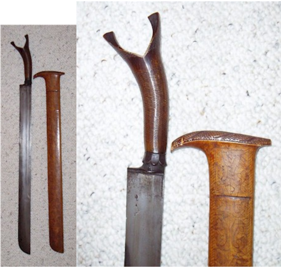
Sword 26- Hulu Tumpang Beunteueng Klewang- Sumatra. Horn handle with iron ferrule and blade. Wood scabbard has intricate carving and inked design. $ SOLD