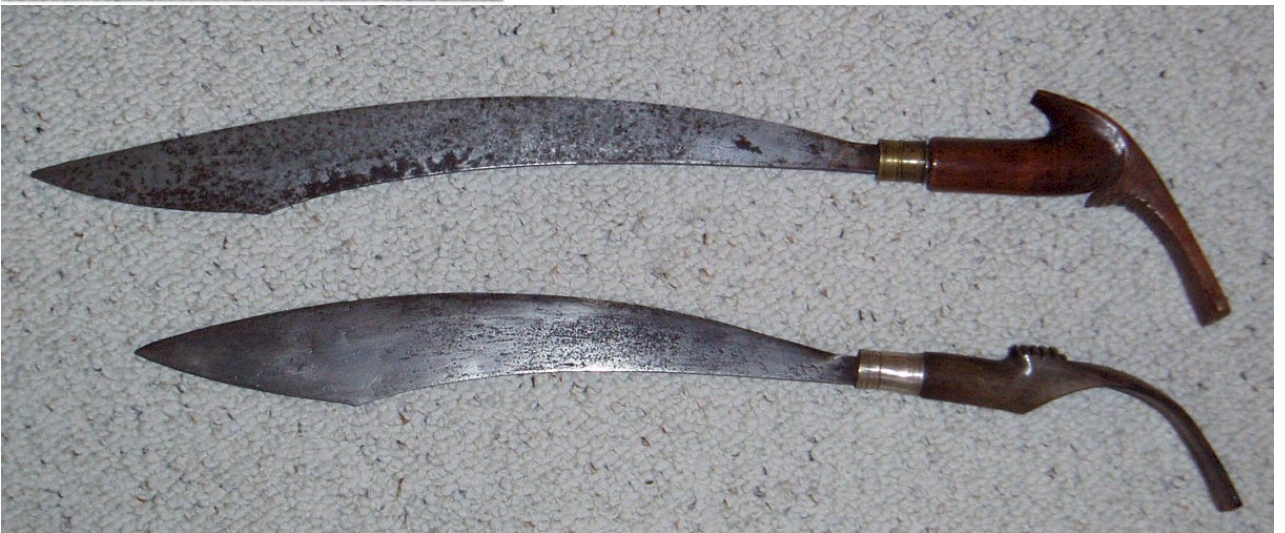
Swords 14 and 15- Pira- Southern Philippines. Two Pira swords. One with wood handle and brass ferrule. One with horn handle and silver ferrule. Sword #14 is SOLD . Sword 15 SOLD Blade is 15 inches long entire sword is 25 inches long.