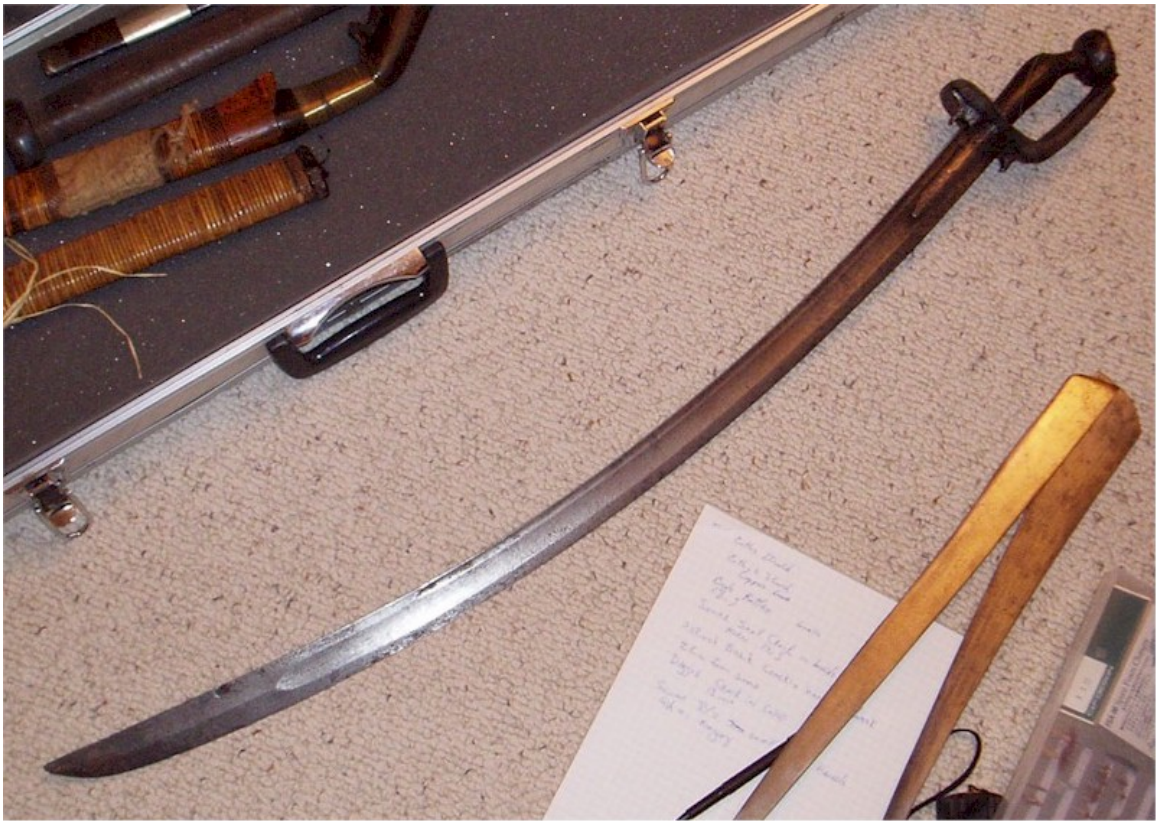
Sword 1 - Hulu Meu Apet Pedang- Sumatra. Iron ore blade and hilt with intricate pattern. Rare - $450.00 Blade is 32inches long and 1/3 inch thick at hilt. Entire sword is 36 inches long.