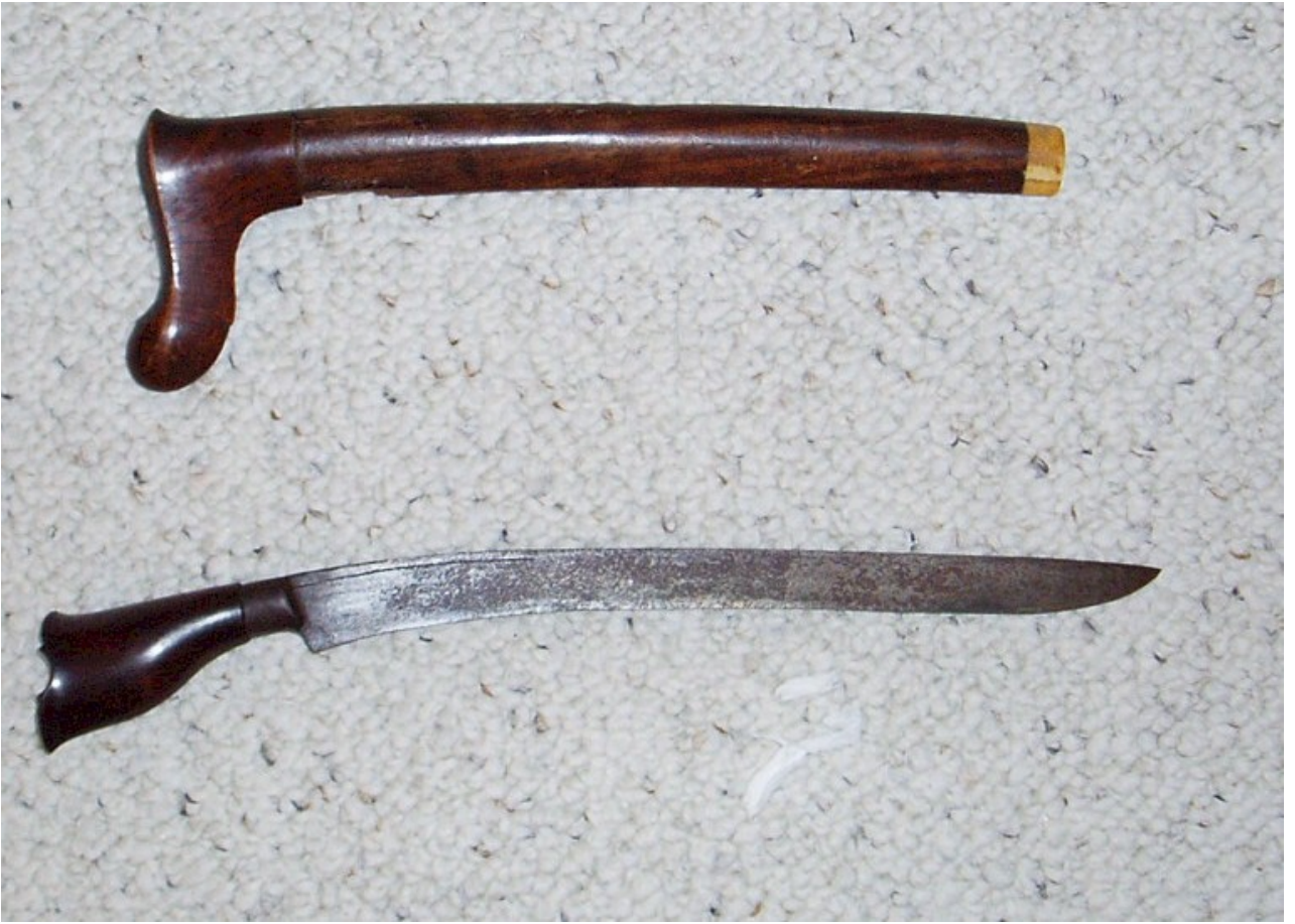
Sword 23. Sewar- Aceh, Sumatra. Wood scabbard with bone or ivory tipping. $155.00 Blade is 11 inches long, entire sewar 13.75 inches long.