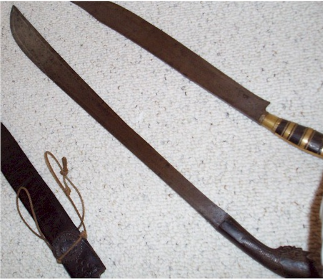
Sword 11- Hulu Tapa Guda Klewang- Sumatra. Long blade with partial bevel along the top. Horn handle. $350.00 Blade is 23.5 inches long, 1.3 inch thick. Sword is 29.5 inches long.