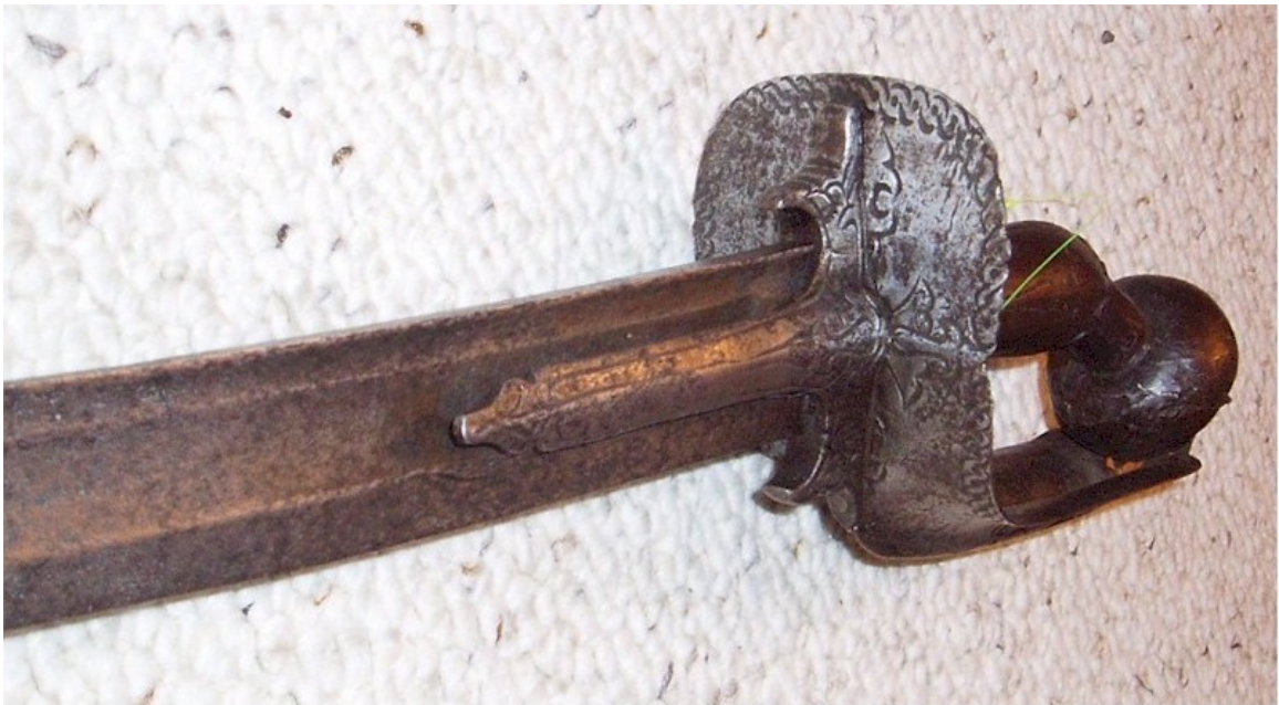
(Yellow "string" is fishing line used to hang sword.)