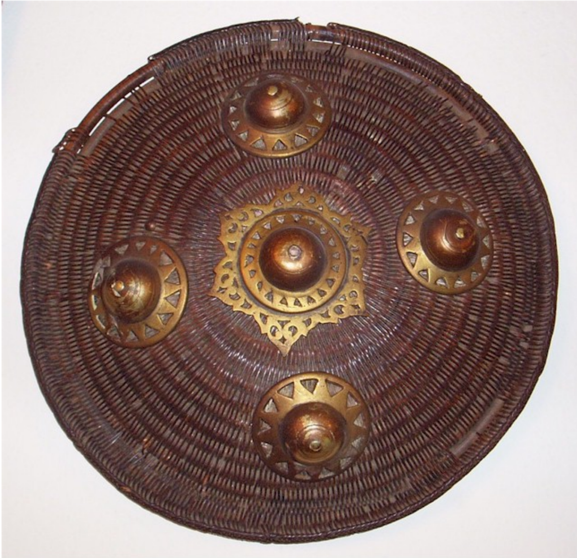
Shield 1 – Peurise Awe- Sumatra. Very Old, Rattan with bronze or brass bosses. - $450.00 Firm.

From the collection of Jim Lowe rodsmith@highcountryflyfisher.com