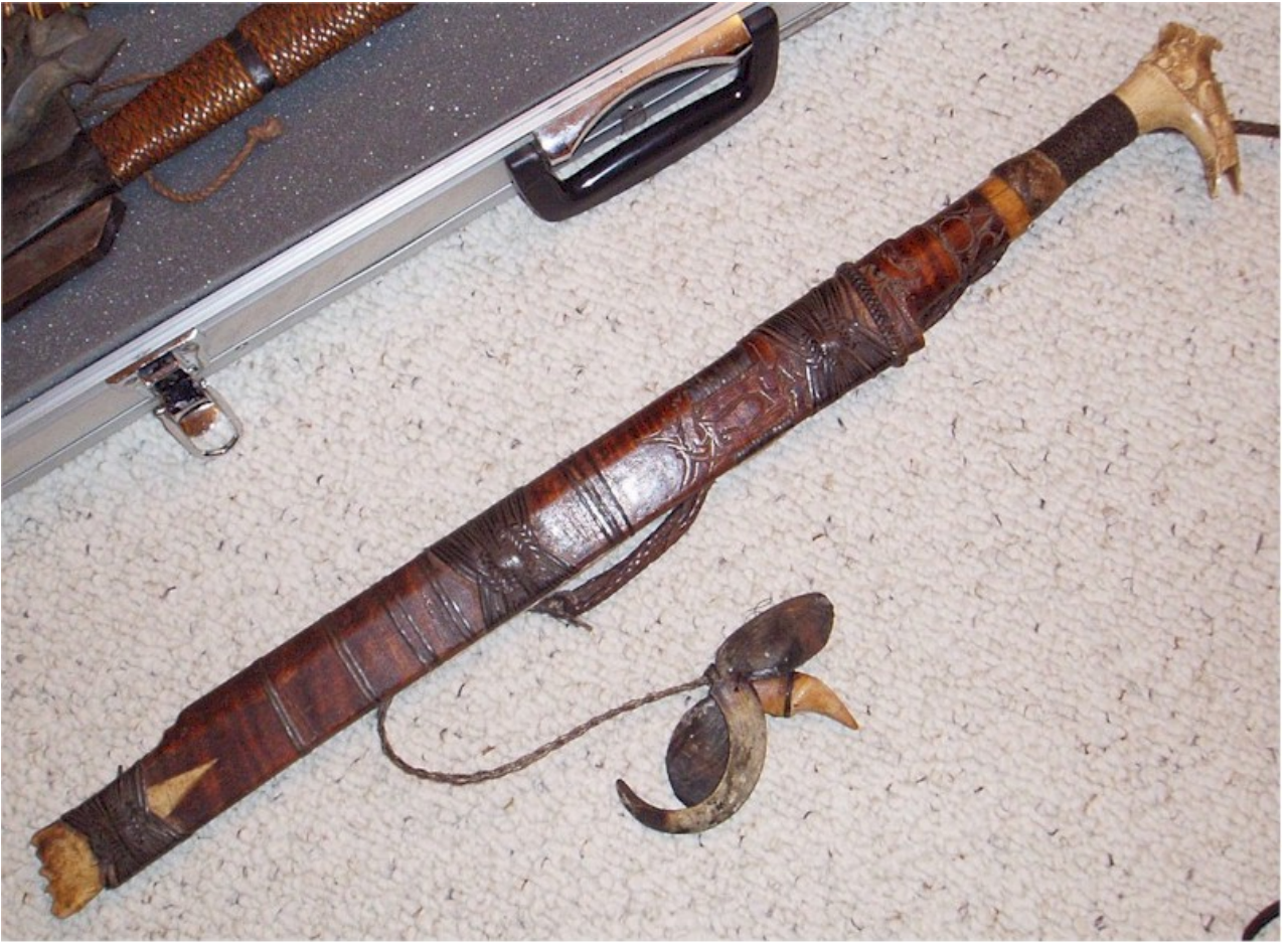
Sword 4. Mandau- Borneo. Blade has brass or bronze inlay the length of the blade. Bone handle with intricate wrap. Intricate carved scabbard with boars tusk and crocodile tooth, bone and possibly ivory tipping. $SOLD