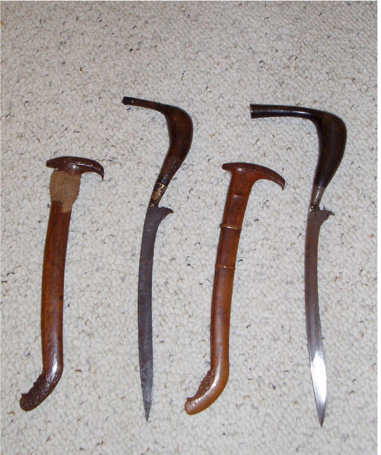
Sword 24 - 25- Rencong- Aceh Sumatra. Horn handle. Wood scabbard with intricate carving. Item 24 has gold inlay in handle. Item 25 has intricate inlaid design. Sword 24- SOLD , Sword 25 - SOLD