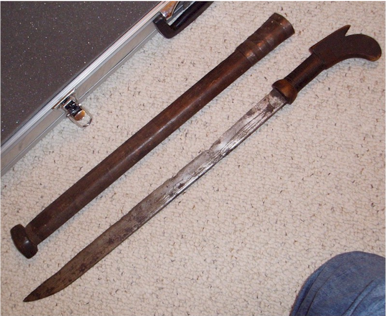
Sword 6- Toraja, Indonesia- Iron Ore blade with pamor. Horn handle with fine rattan wraps. Wood scabbard with silver or Swiss Silver ferrules. $250.00