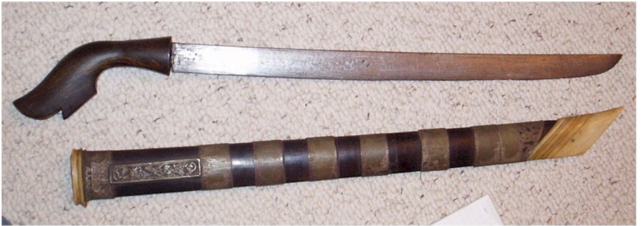
Sword 3- Horn handle. Scabbard with intricate brass or bronze ferrules and bone tipping. Java, Indonesia. $175.00