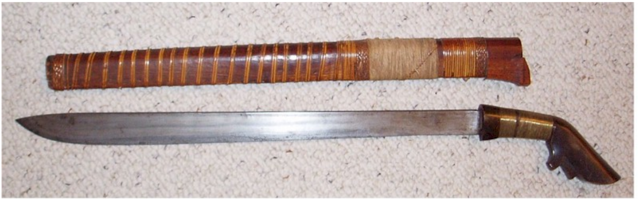
Sword 5. Parang, Indonesia. Etched blade with horn handle and fine brass thread wrap. Scabbard has very fine and intricate rattan wraps. $250.00