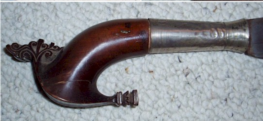
Sword 10- Barong- Southern Philippines. Elaborate wood handle with silver ferrule and acid etched blade. Wood scabbard with intricate carving, fine rattan wraps and mother of pearl inlay. $500.00