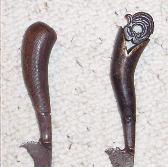
Sword 9a and 9b- Hulu Puntung Rencong- Sumatra. Sword 9a- $ SOLD , Sword 9b - SOLD