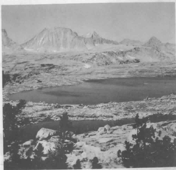
Big and Little French Lakes

PDF Courtesy of HighCountryFlyfisher.com