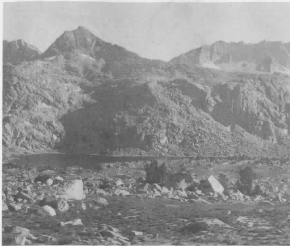
Lower Golden Trout Lake

5. Golden Trout Lake, Lower. Elev. 10,775; 23.8 acres; 26 feet deep; good food and excellent spawning; contains plentiful self-sustaining fishery of 3 to 9 inch golden in good condition. No need to plant. Often excellent fishing may be found in the stream below this lake.