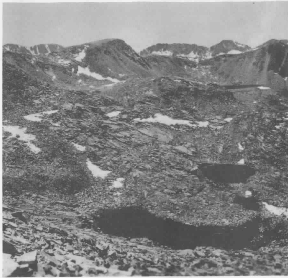
Upper Petite and La Tete Lakes (foreground)

5. French Canyon Creek. Elev. 9,525 to 11,620; 6 miles long; high montane, cascading to rapid "brook" with mostly open, turf-lined banks; good pools and fair shelter; good natural propagation and stream entirely self-sustaining with golden and golden-rainbow hybrids averaging about six inches.