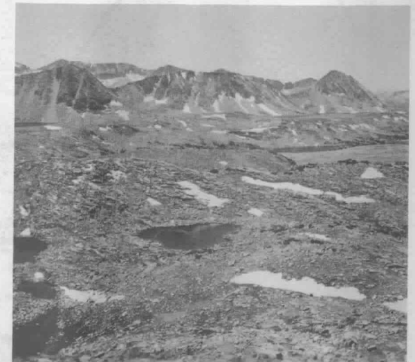
South Half of French Canyon Toward Pilot Knob

4. Elba Lake. Elev. 10,900; 17 acres; possibly 40 feet deep; fair productivity and spawning. Contains golden trout and golden-rainbow hybrids in good numbers up to 12 inches. Requires occasional booster air plants of fingerling golden.