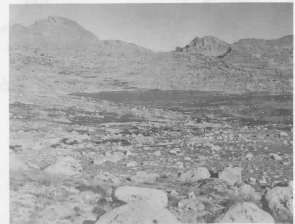
Little Desolation Lake

4. Forsaken Lake Tributary to Big Desolation Lake from East. Elev. 11,500; 3 acres; 10 feet deep; low productivity and poor spawning. Small population of golden trout to 12 inches. Occasional restocking required.